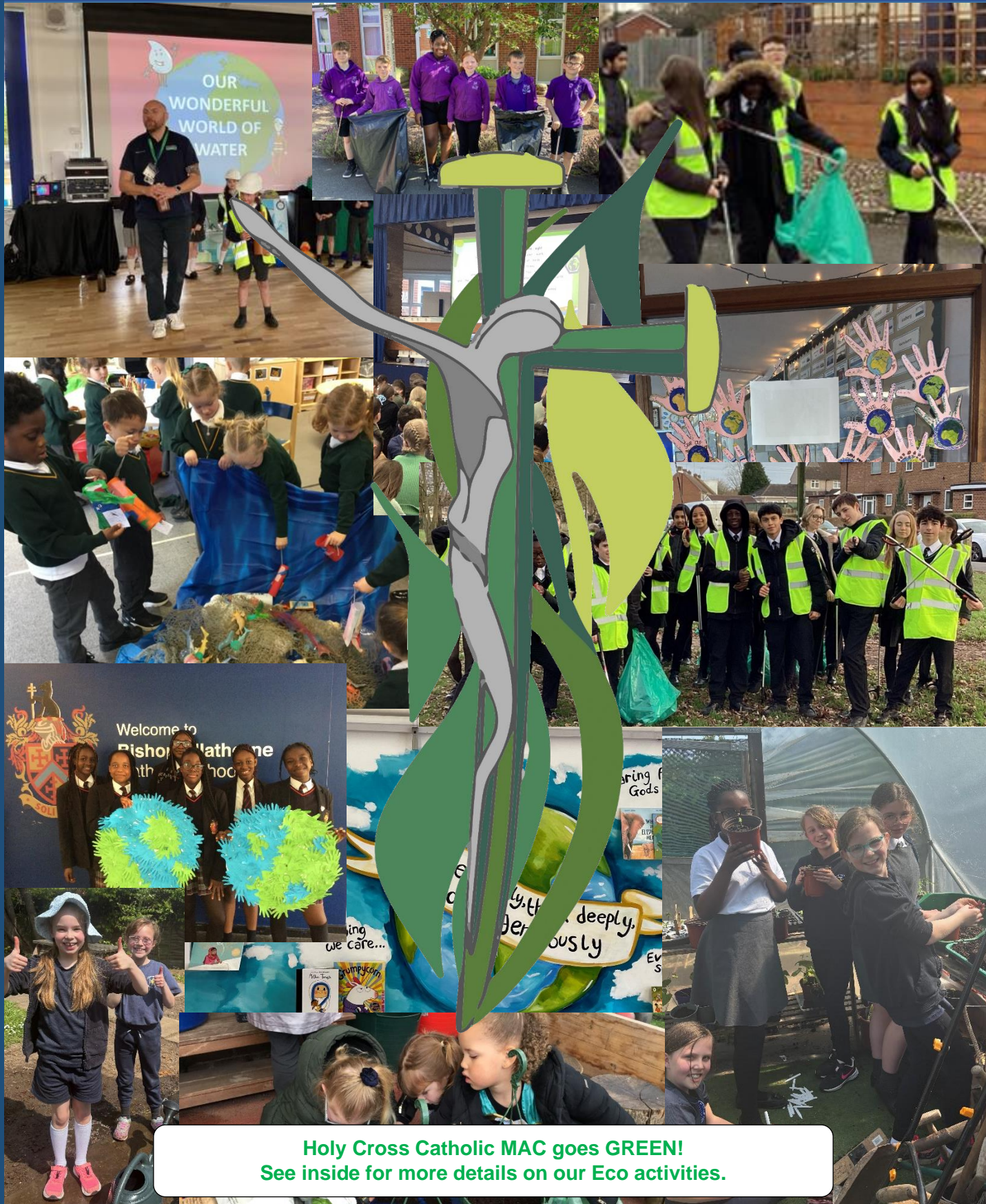
Holy Cross Catholic MAC goes GREEN! See inside for more details on our Eco activities.